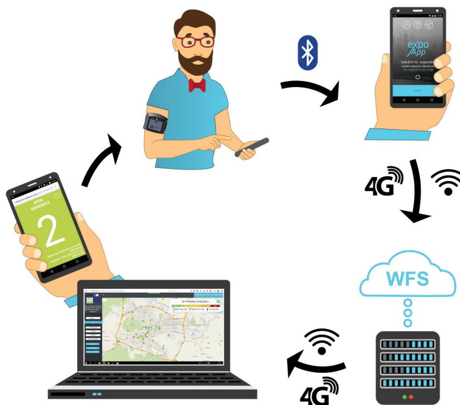
Figure 2. Data flow from the sensor system to the user via a smartphone and the server.

For data collection, the LEO device was paired via a Bluetooth 2.1 connection with an Android smartphone. An app (ExpoApp) allowed the smartphone's Global Positioning System (GPS) unit to log the user's geolocation while collecting data. With a 10 s sampling frequency, the smartphone was capable of sending 1121 bytes of data every minute to a Web Feature Service (WFS) server via Wi-Fi or cellular data. A time-stamped signal of the individual sensors, GPS coordinates and accelerometer data were also sent to the server where the data was stored and processed. The data was visualized back to the user in near real time through the ExpoApp app, as a 5 scale Air Pollution INdicator value (APIN). Figure 2 shows the data flow of the system.