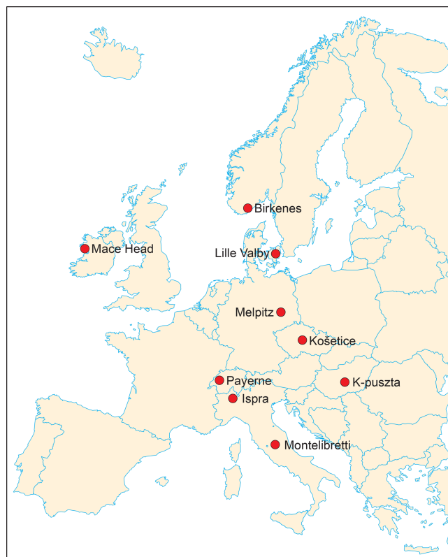
Figure 1. Overview of sampling sites participating in the carbonaceous aerosol source apportionment study in the EMEP Intensive Measurement Periods (IMPs) in fall 2008 and winter/spring 2009.

The EMEP (European Measurement and Evaluation Programme) Task Force on Measurements and Modelling (TFMM) periodically arranges Intensive Measurement Periods (IMPs) as a supplement to the continuous monitoring in EMEP (Aas et al., 2012). The present study is part of the second EMEP IMP, which was organized in cooperation with the EU-funded project EUCAARI (European Integrated project on Aerosol, Cloud, Climate, and Air Quality Interactions; Kulmala et al., 2009; Crippa et al., 2014) in fall 2008 and winter/spring 2009. In this study, a collection of aerosol filter samples and measurements of ^{14}\text{C} , levoglucosan, and OC/EC were harmonized using common protocol and analysis in centralized laboratories. The objective was to provide quantitative estimates of carbonaceous aerosol from fossil-fuel, biomass burning, and natural sources in the European rural background environment and to study their relative contribution in two transition periods, in which a noticeable signal from all the considered sources was expected. The carbonaceous aerosol apportioned to biomass burning was