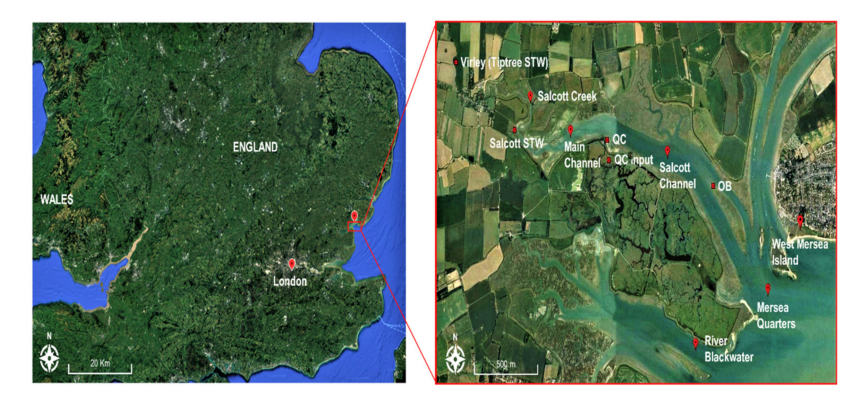
Figure 1. Map of the study site, Salcott Creek Channel, Essex, UK showing the location of the sampling sites.

reductions in the numbers of oysters in the estuary have raised concerns about the possible increased levels of water contamination. The identification of the main sources of faecal pollution contaminating the oysters will provide the basis for an effective management plan.