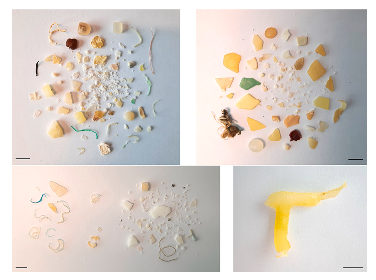
Fig. 1. Pictures of plastics found in fulmars' stomachs. Each picture represents one sample. The scale bar represents 5 mm. Some particles were smashed during the FTIR analyses and therefore some pieces in this figure are smaller than 1 mm.