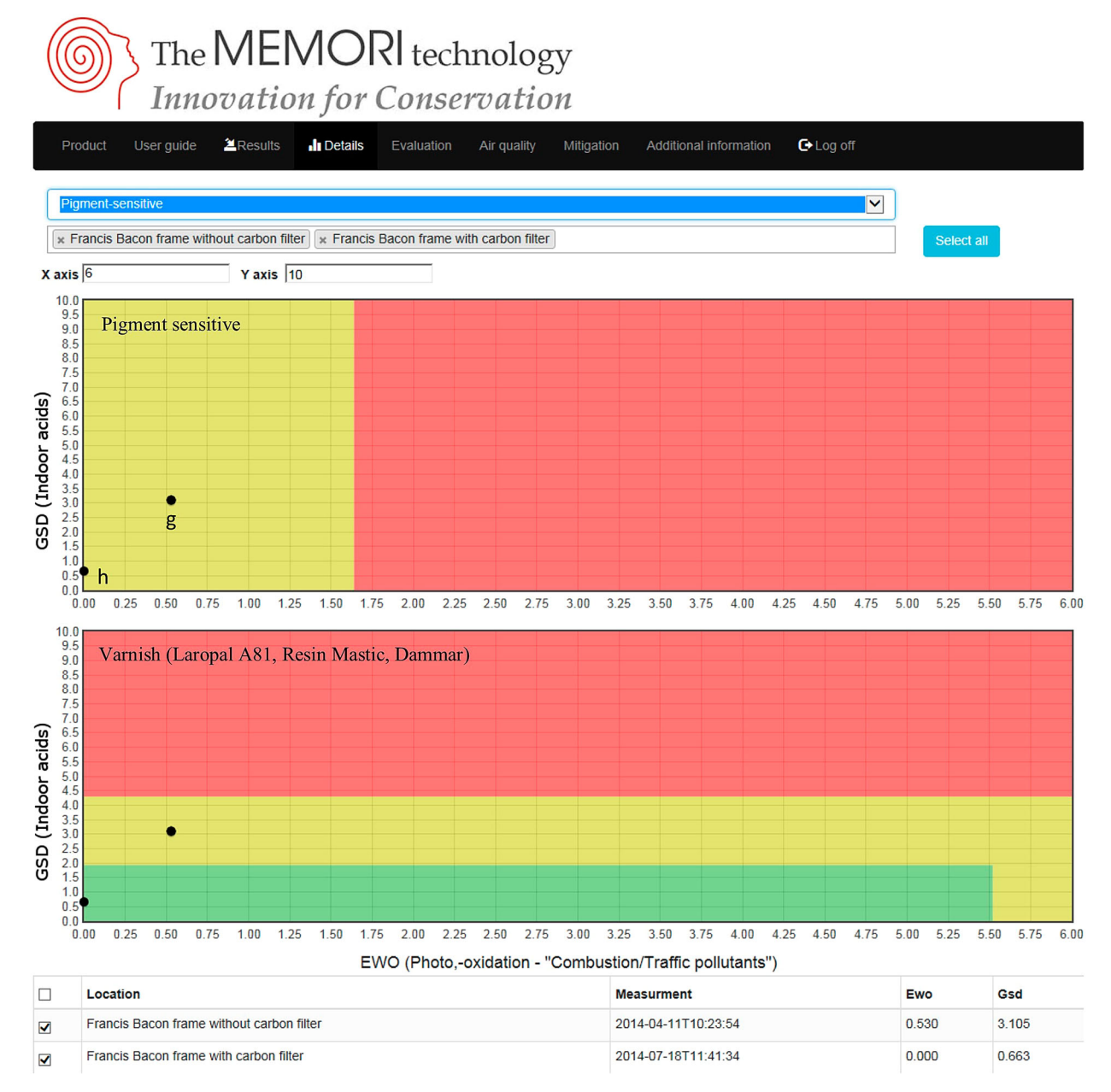
Figure 8 MEMORI results from measurements in the Tate locations, with colour evaluation for sensitive pigments and varnishes; inside the Francis Bacon frame without carbon filter (g) and with carbon filter installed (h).

two showcases, the low surface area-to-case volume ratio appeared to result in low concentrations, and thus low GSD readings. It is unlikely that corrosion damage will be observed on copper alloys or ceramics in these cases within 30 years.