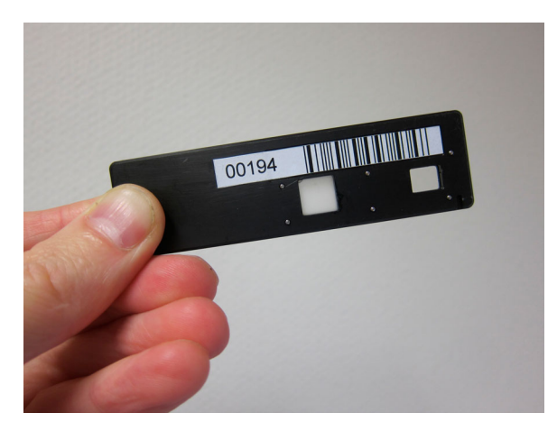
Figure 5 The MEMORI dosimeter.

The results are displayed on the web page as a 'traffic light signal'. The user can select between 22 heritage materials for the risk evaluation. 'Green' indicates that, within the constraints of present knowledge, it is unlikely that the materials will change significantly within a period of perhaps 30 years. 'Red' indicates