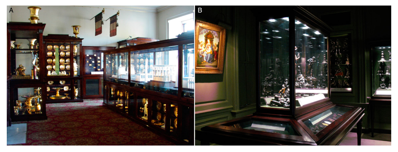
Figure 2 MEMORI measurement locations in English Heritage sites. (A) Apsley House, plate, and china room. (B) Ranger's House, bronzes room, showing the centre showcase (desktop) in foreground, the alcove case back left, and the corner case back right.

The boxes were specifically designed for the storage of these materials, but constructed with different types of high impurity, chemically unstable, low-grade