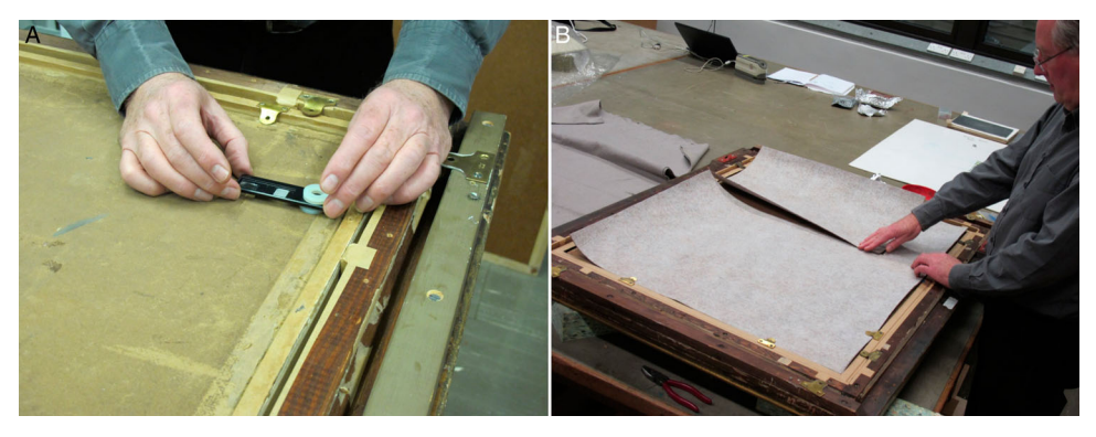
Figure 3 (A) Fixing the MEMORI dosimeter close to the verso of the panel inside the middle Bacon Frame (sitting face down on a table) using spacers on either side to ensure air circulation. The backboard was placed on top and attached to the frame edges. (B) Inserting carbon cloth over the verso of the panel in the Bacon frame before positioning the second dosimeter, as shown.

boards. The oldest units were manufactured in the 1930s and progressively replaced in the early 1970s by newer models. The design evolved throughout the years, but the quality of the materials did not improve until the very latest ones fabricated in the late 1990s.