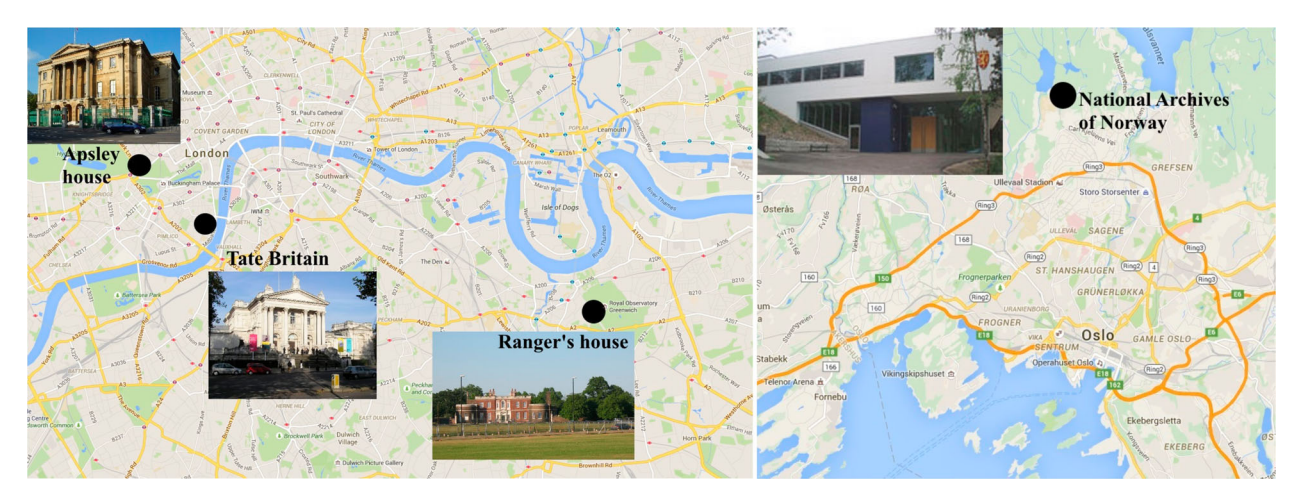
Figure 1 The measurement sites (photos: Google maps, Wikipedia).

given to the choice of materials being enclosed with, and around, artworks. The present concern is that internally generated pollution, which is not one of the major causes of deterioration in open storage, may be present in high concentrations in enclosed spaces and therefore should now be considered. Measurement of volatile organic acid concentrations is an important step in this study.