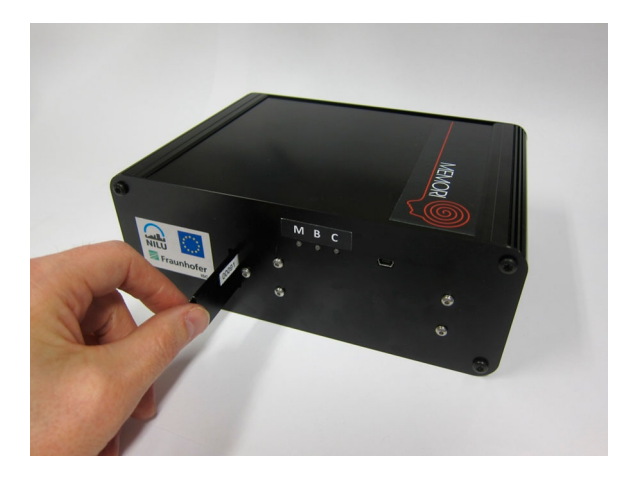
Figure 6 Measuring of the MEMORI dosimeter.