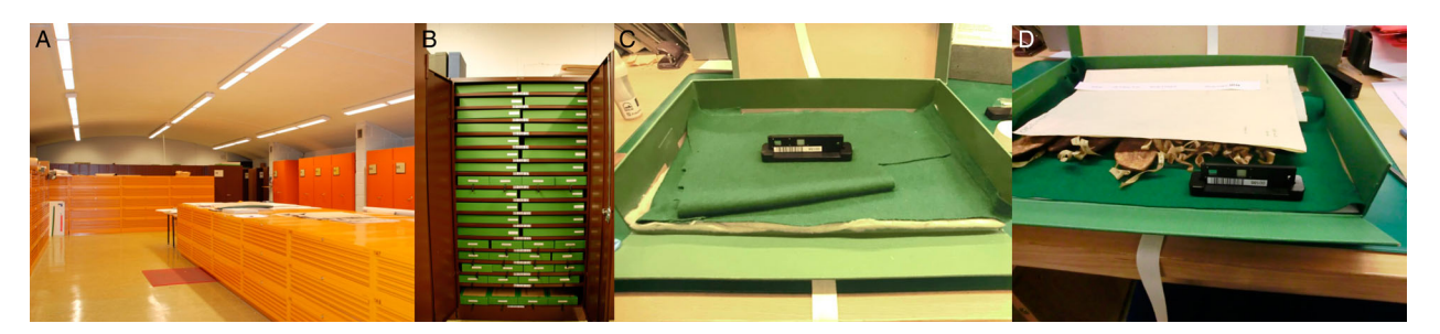
Figure 4 MEMORI measurement locations in the National Archives of Norway. (A) store room, (B) archive solid board boxes, (C) measurement in box without documents, and (D) measurement in box with documents.

The MEMORI technology consists of a dosimeter, a small dosimeter reader, and the MEMORI web pages for evaluation of results, and information on