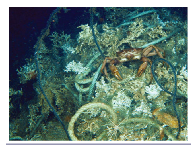
Fig. 3. Cold water coral reef with entangled fishing gear, indicating the Memory Effect of marine litter relevant to descriptor 11 of the Marine Strategy Framework Directive (Söffker et al. 2011). Nonbiodegradable ropes are likely to remain entangled in the reefs for decades, at the least.

The examples in Table 1 illustrate three different types of Future Effect: those related to atmospheric, terrestrial, and sedimentary nonmarine pools. Anthropogenic sources of carbon dioxide in the atmosphere will result in ocean acidification. Warming of the oceans will alter biogeochemical processes, which will cause the release of accumulated contaminants in sediments back into the marine environment (see Schiedek et al. 2007 for a review). The Future Effects associated with the Black Sea case study are associated with pools of nutrients currently outside the marine environment where reservoirs of silica are bound up in the lakes created by the damming of the River Danube (Humborg et al. 1997); this silica will ultimately be transported to the Black Sea at an unknown time in the future.