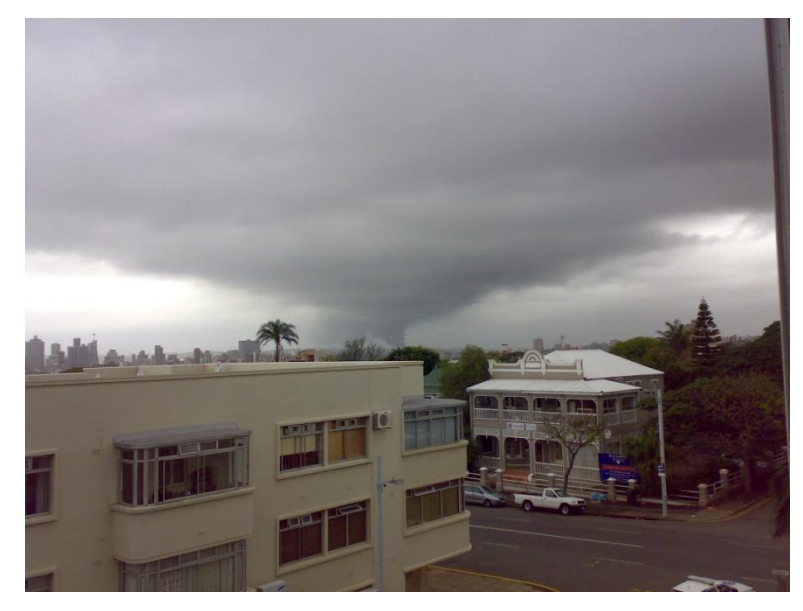
Figure 1: Flaring from the SAPREF refinery show that the main body of the pollution is travelling aloft. The picture is taken from Morningside.

When the gas is combusted in the flare a lot of heat is generated from the burning of hydrocarbons. This heat will induce buoyancy and the plume will gain altitude in the atmosphere. The height that the gases will reach is dependent on the amount of energy released in the combustion process and the atmospheric conditions such as wind speed, wind direction and atmospheric stability. If a large amount of gas is flared the gases will rise to substantial heights and not impact locally as seen from Figure 1 where the flue gas is rapidly rising to several thousand meters. The flare from the refinery is overloaded and is therefore producing large quantities of particulate matter. The picture is from November 2007. The picture was taken from Morningside and it is seen that the smoke from the flare is rising and travels over Morningside and have no impact at Morningside but further away. The pollutants in this case will not have a big impact locally, but will have a regional effect.