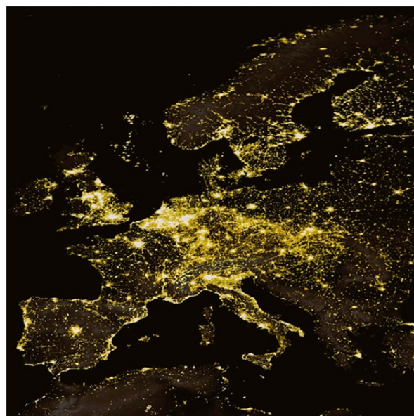
Fig. 2. A nocturne satellite photograph of Europe. Dense lights correspond to populated areas, thus areas where CAFs are readily available.

Another consideration generated after seeing the first results of CAF analyses, is that used CAFs may contain a considerable amount of toxic substances. Zhang et al. (2011) measured hundreds of pg of dioxins and furans at each exposed CAF and Katsoyiannis et al. (2012) reported an average of 1700 µg/CAF for the heavier PAHs. Cai et al. (2014) reported an average of 4170 µg/CAF of PAHs (again, only the heavier PAHs were reported) and also 63.2, 2778, 5385 and 14116 µg/CAF, of Cd, Pb, Cu and Zn, respectively. It is reasonably anticipated that CAFs are capturing also all other classes of the afore-mentioned chemicals, that tend to bind on PM. This trapping and accumulation of organic chemicals is something that should be taken into consideration by environmental agencies and/or local authorities, because CAFs, at the end of their deployment lifetime constitute a type of a “special waste” which should not be disposed of carelessly, as it is happening so far. Treatment of CAFs as normal waste, suggests that in the end of their use, the persistent chemicals that have been accumulated on their surfaces are returning to the environment. A fast estimation of the amount of chemicals that are returning to the environment, as a result of the improper disposal of CAFs, results in hundreds of kilos of toxic chemicals. Just in the UK alone, according to an English website (Waymarking.com, 2009), there are 52000 taxis. If we assume that every taxi