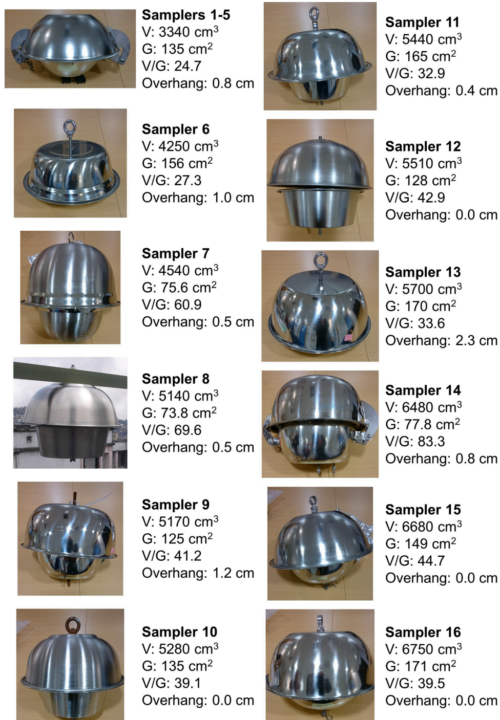
Fig. 1. Sampler designs used in the study and their basic dimensions. V indicates volume, G indicates the area of the horizontal gap between upper and lower dome, V/G is the ratio of the dome volume to gap area, and overhang is the distance the upper dome extends over the lower dome.

All PUF disks were analyzed according to accredited analytical methods (ČSN EN ISO 17025: 2018) for 8 PCB congeners (7 indicator PCBs + PCB 11), 12 OCPs (chlorobenzenes, hexachlorocyclohexanes - HCHs, dichlorodiphenyltrichloroethane and associated metabolites - DDX compounds), 29 PAHs and 10 PBDE congeners; compounds are