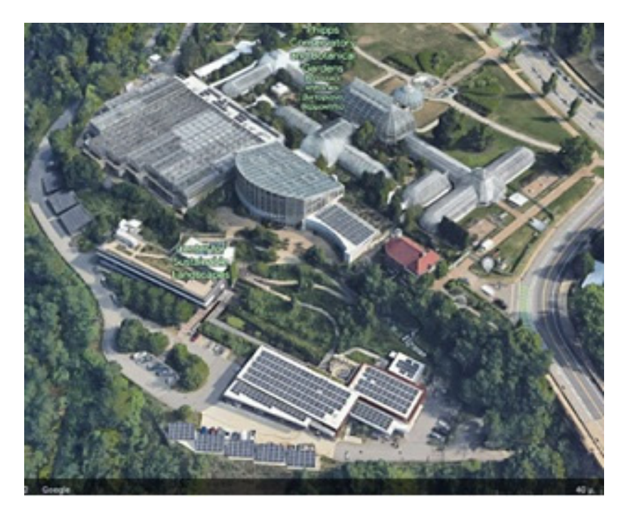
Figure 3. The Centre for Sustainable Landscapes is part of the Phipps Conservatory and Botanical Gardens.

reuse. This holistic approach ensures that the Centre minimizes its reliance on external resources, achieving self-sustainability in terms of energy and water usage. The example of the Centre for Sustainable Landscapes clearly illustrates that the integration of NBS and solar energy technologies, both passive and active, can enable the attainment of net-zero resource consumption. It demonstrates the feasibility of merging these approaches to create self-sustained and environmentally conscious built environments. This case serves as a compelling testament to the potential of synergistic solutions in advancing sustainable urban development and inspiring future projects.